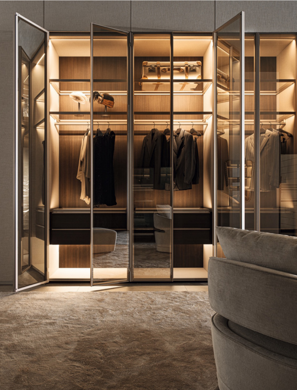
Gliss Master Wardrobe Vincent Van Duysen Arial Boiserie Studio Klass Palette Carpet Nicola Gallizia