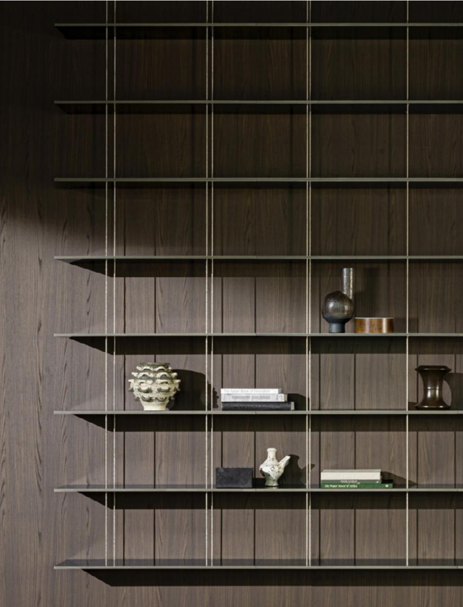
Graduate Bookshelf Jean Nouvel Diamond Table Patricia Urquiola