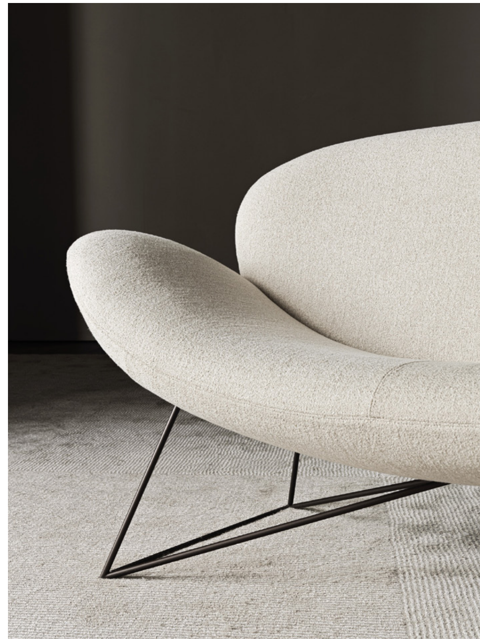
D.157.6 Due Foglie Sofa Gio Ponti