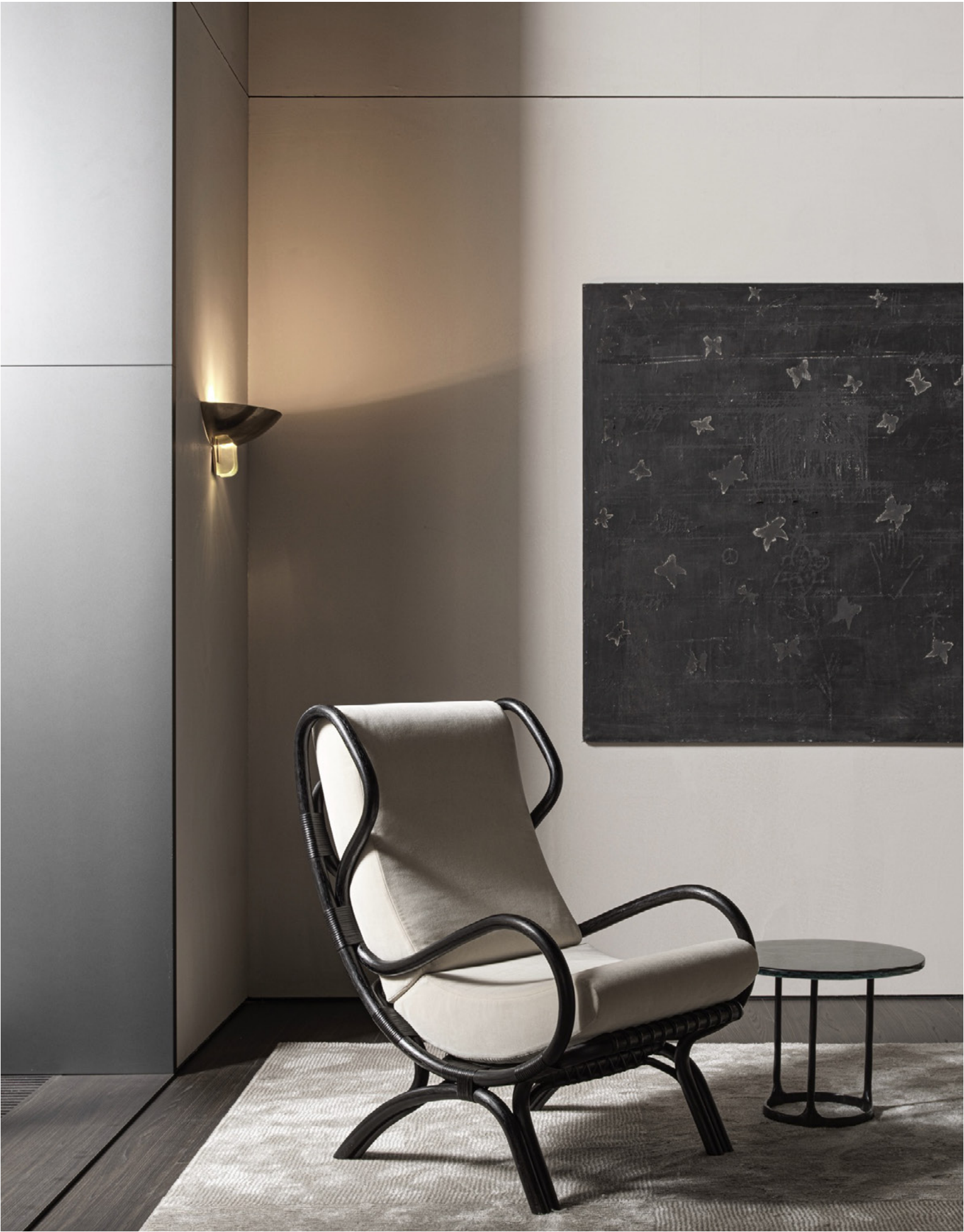
Continuum D.163.7 by Bonacina 1889 Armchair Gio Ponti