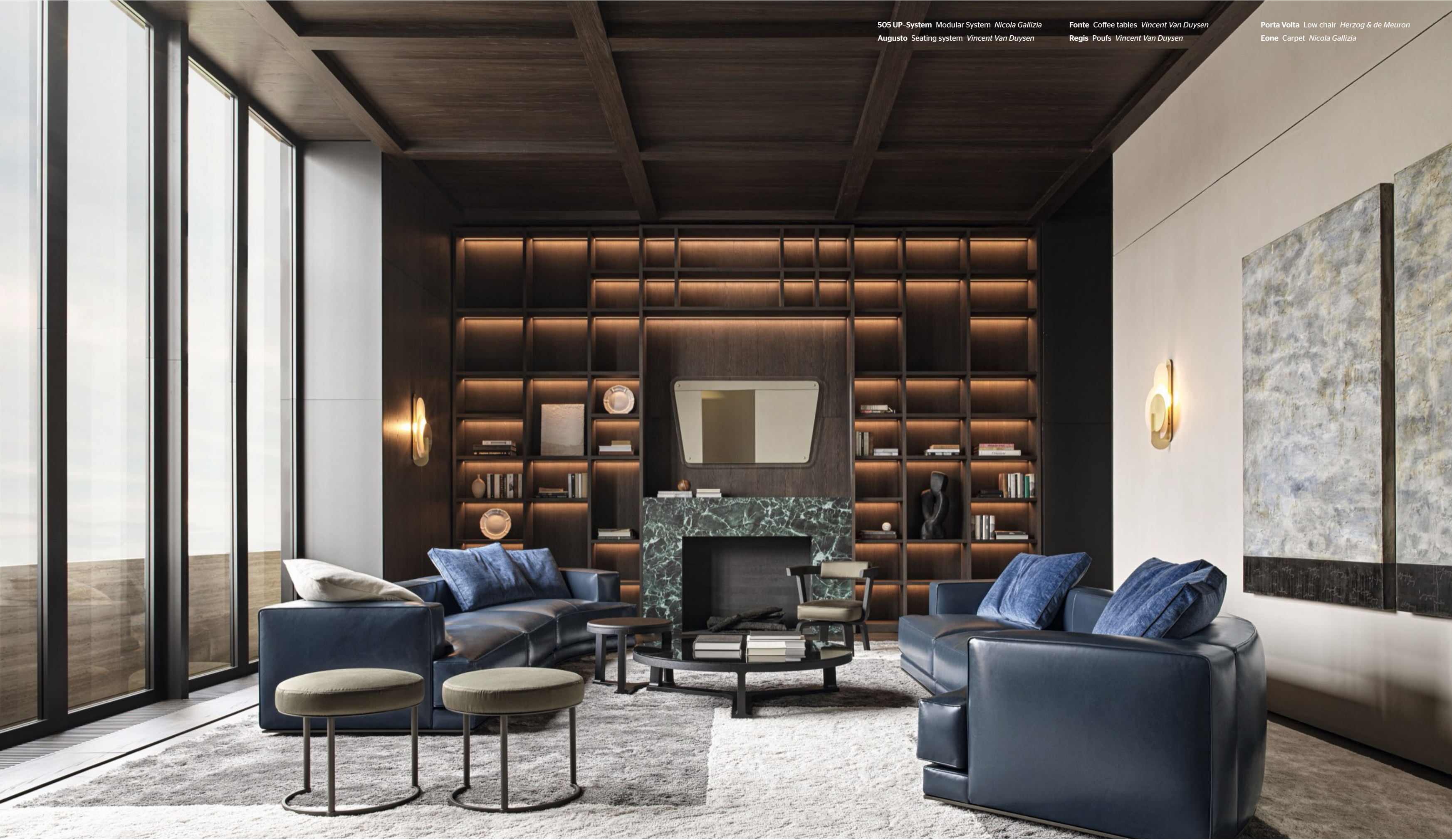
505 UP-System Modular System Nicola Gallizia Augusto Seating system Vincent Van Duysen