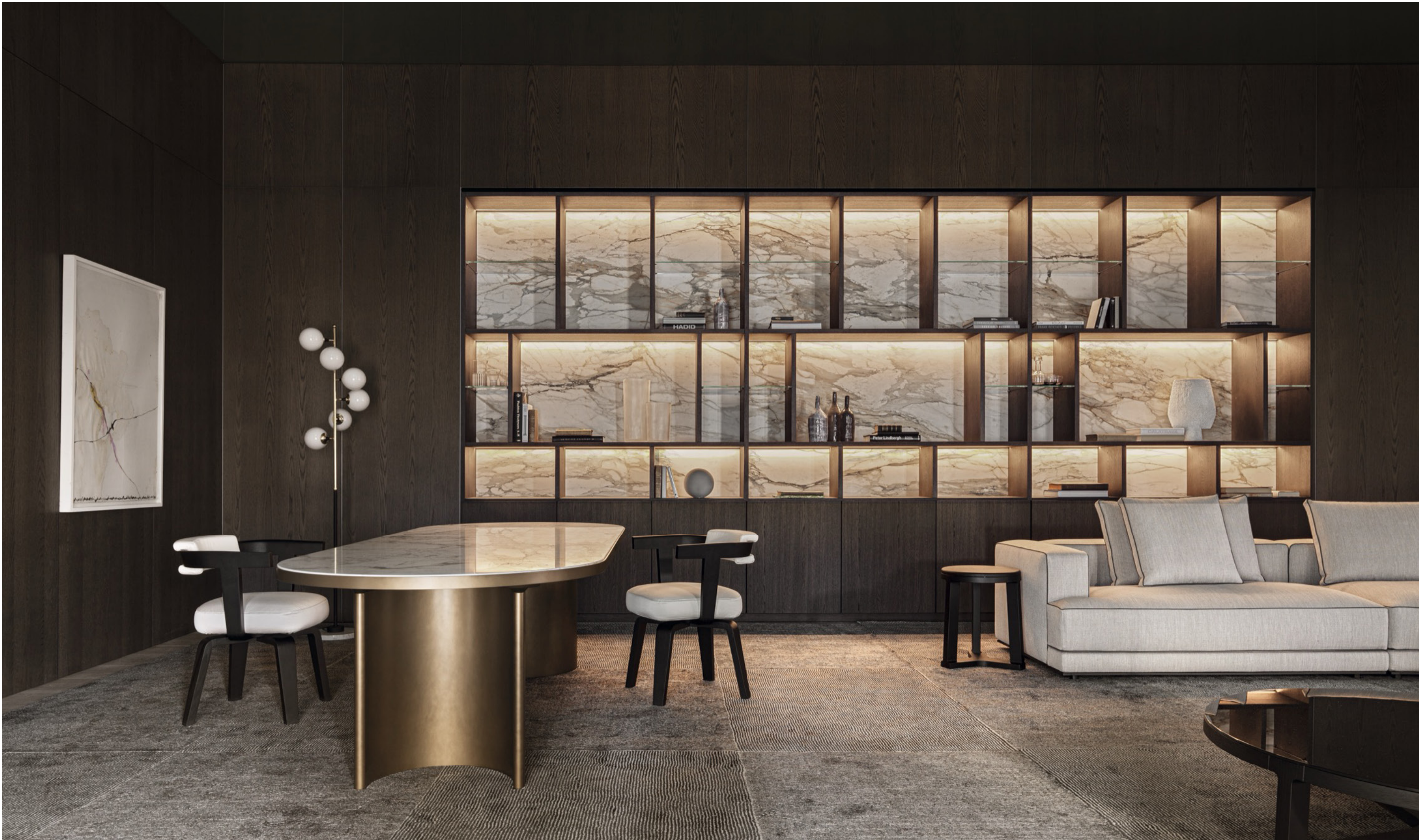
505 UP-System Modular System Nicola Gallizia Arial Boiserie Studio Klass