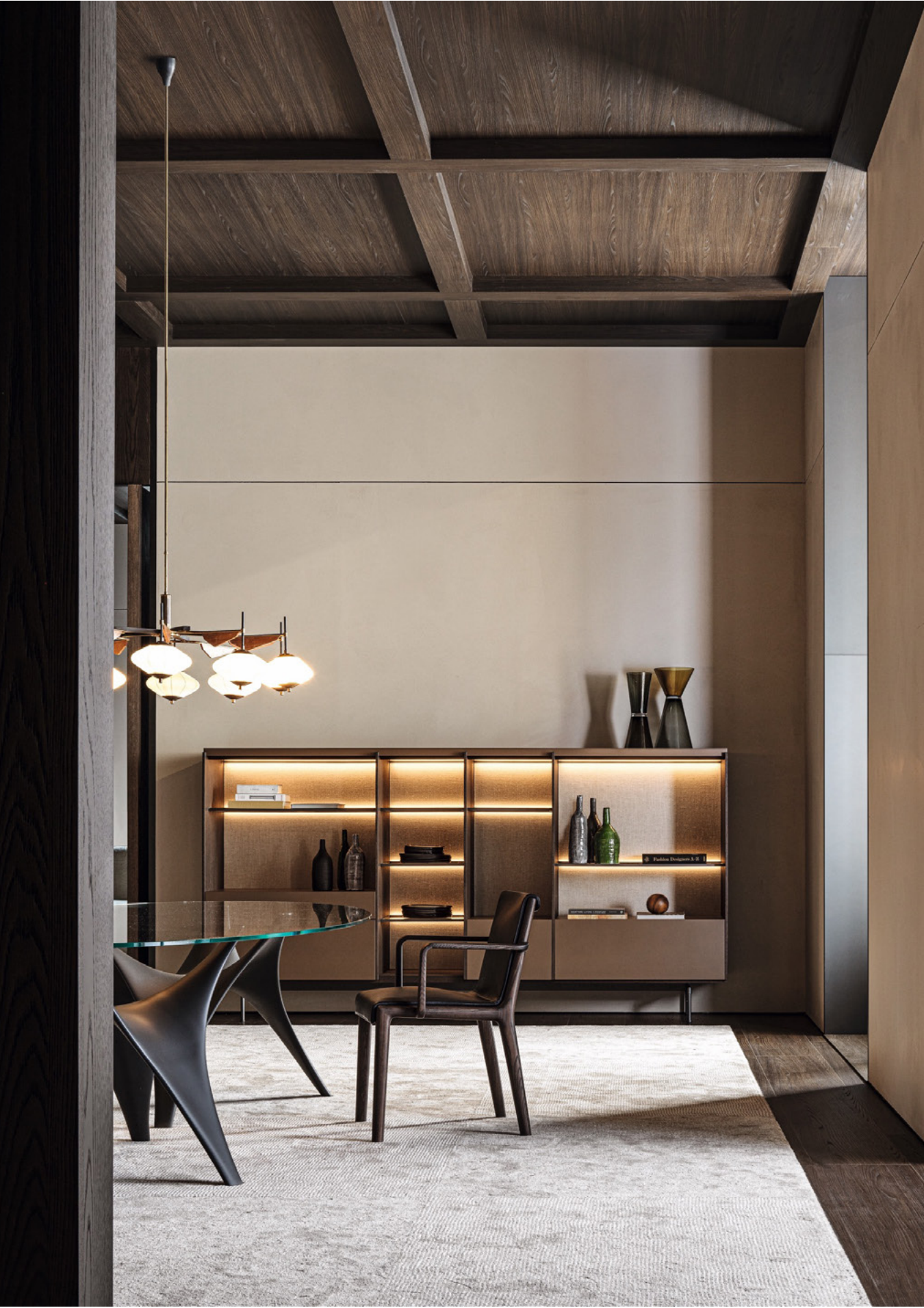
Logos Living System Vincent Van Duysen Arc Table Foster + Partners