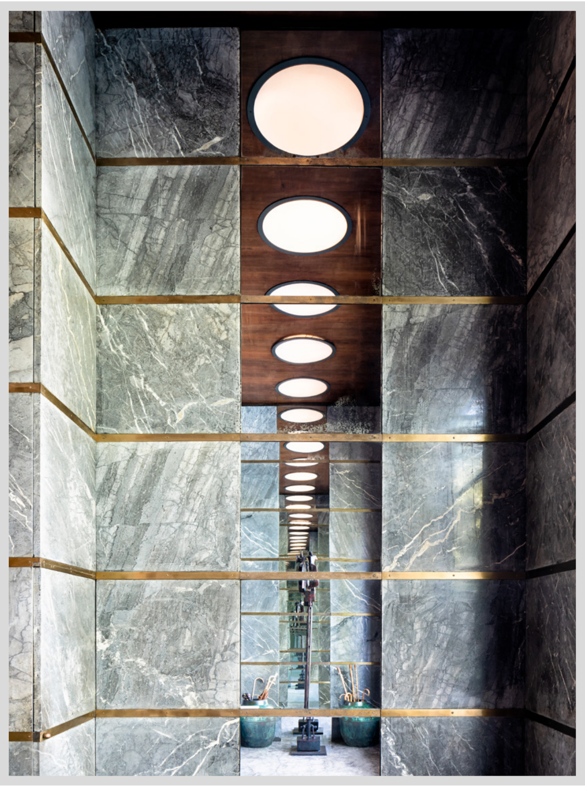
VILLA NECCHI CAMPIGLIO, MARBLE PATTERNING ON THE WALL AND THE ENTRANCE