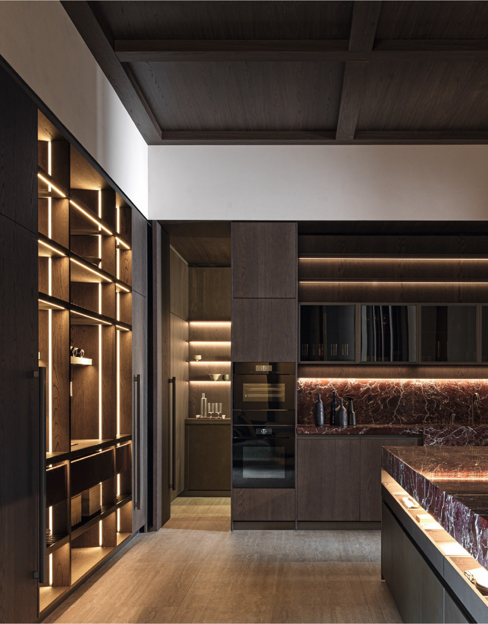
VVD Kitchen Vincent Van Duysen Atelier Columns Vincent Van Duysen