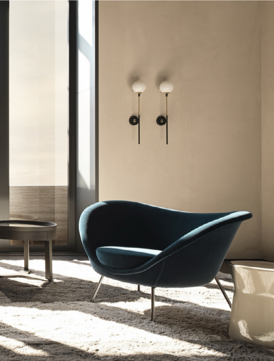
Logos Living System Vincent Van Duysen D. 154.2 Armchair Gio Ponti