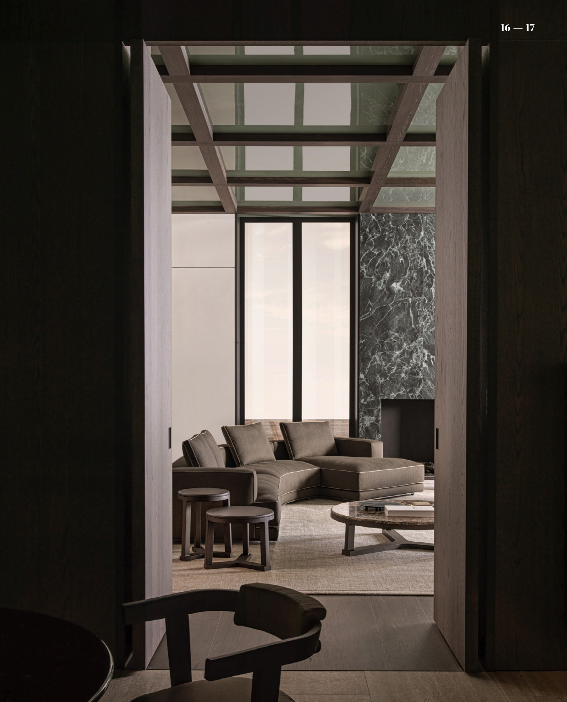
Augusto Seating system Vincent Van Duysen Fonte Coffee tables Vincent Van Duysen