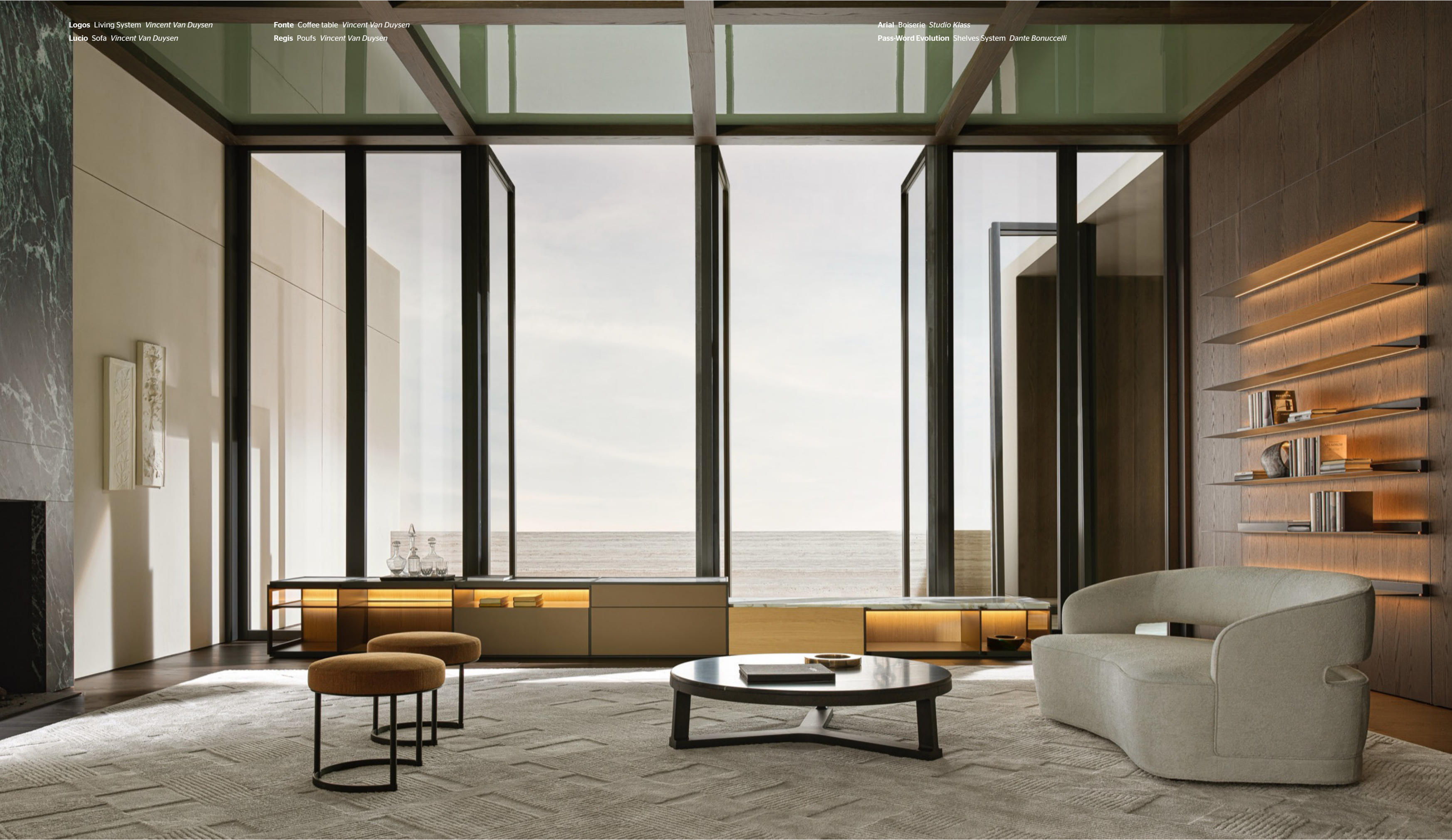
Logos Living System Vincent Van Duysen Lucio Sofa Vincent Van Duysen