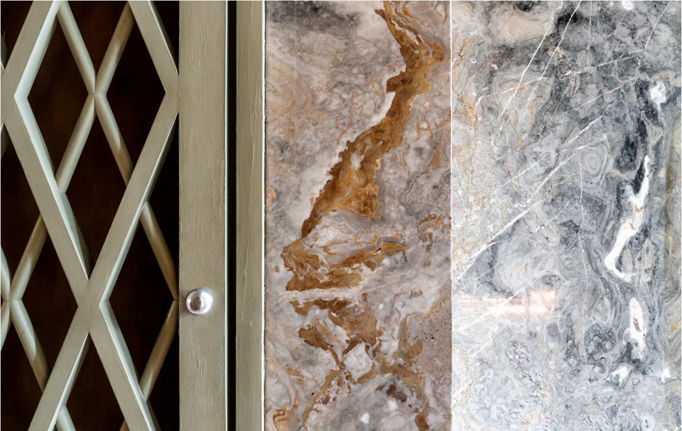
VILLA NECCHI CAMPIGLIO, DETAILS

Gli arredi trovano così un'armonia ricca e bilanciata in termini di materiali, textures, palette colori e linee, ripercorrendo sotto la lente creativa di Vincent Van Duysen le gloriose tracce architettoniche e progettuali di Portaluppi nella sua amata Milano. Il fulcro di ispirazione e osservazione è Villa Necchi Campiglio , in rappresentanza dell'eleganza del mondo residenziale privato.