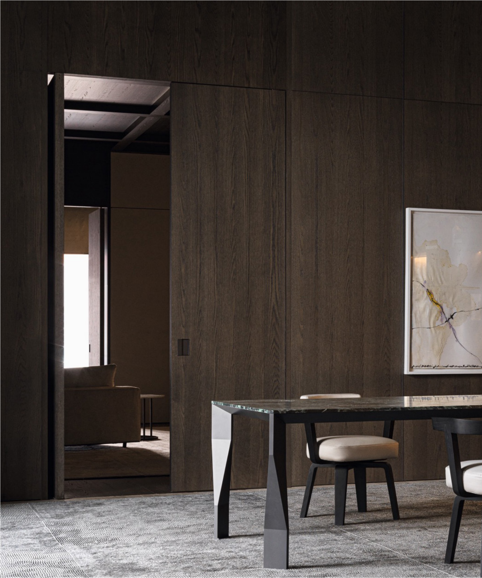
Arial Boiserie Studio Klass Arial Doors Studio Klass