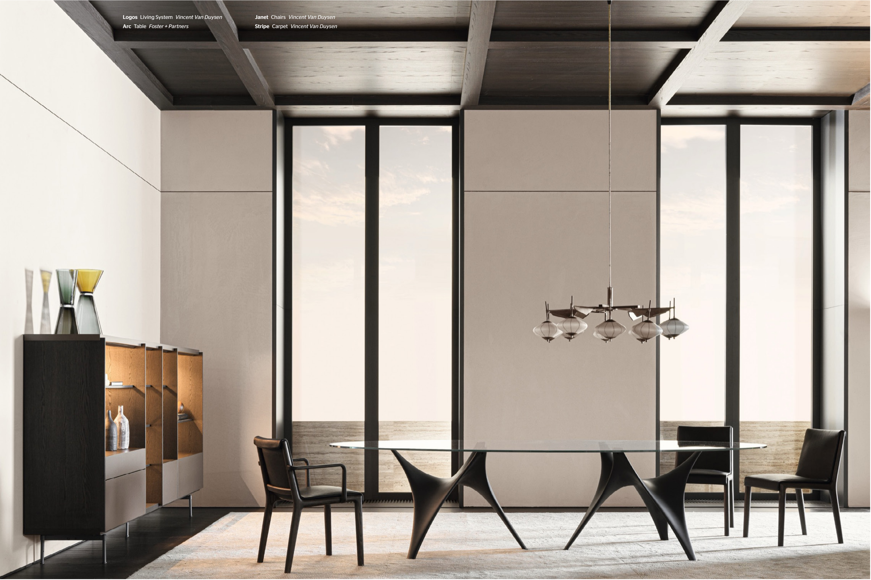
Logos Living System Vincent Van Duysen Arc Table Foster + Partners