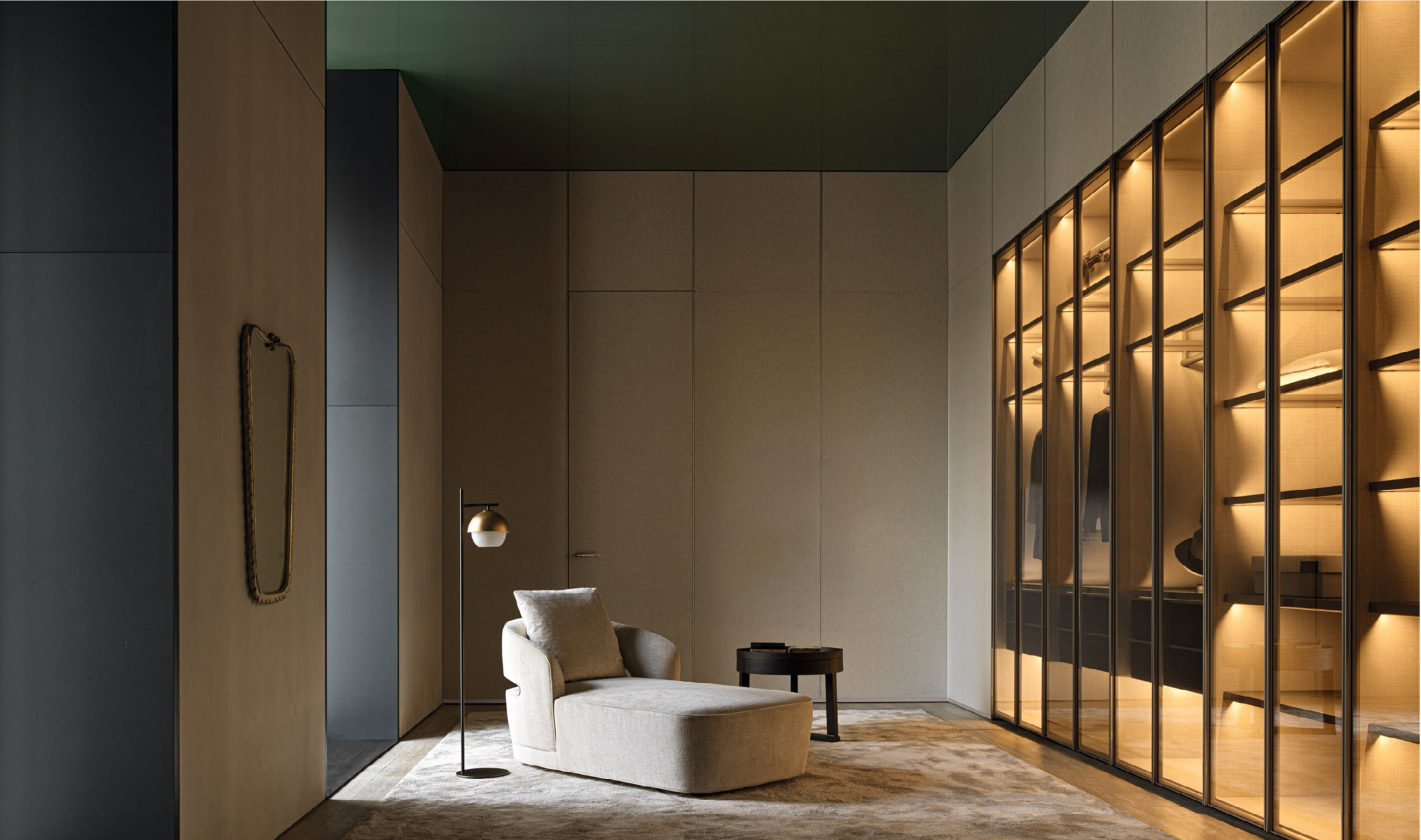
Gliss Master Wardrobe Vincent Van Duysen Lucio Dormeuse Vincent Van Duysen