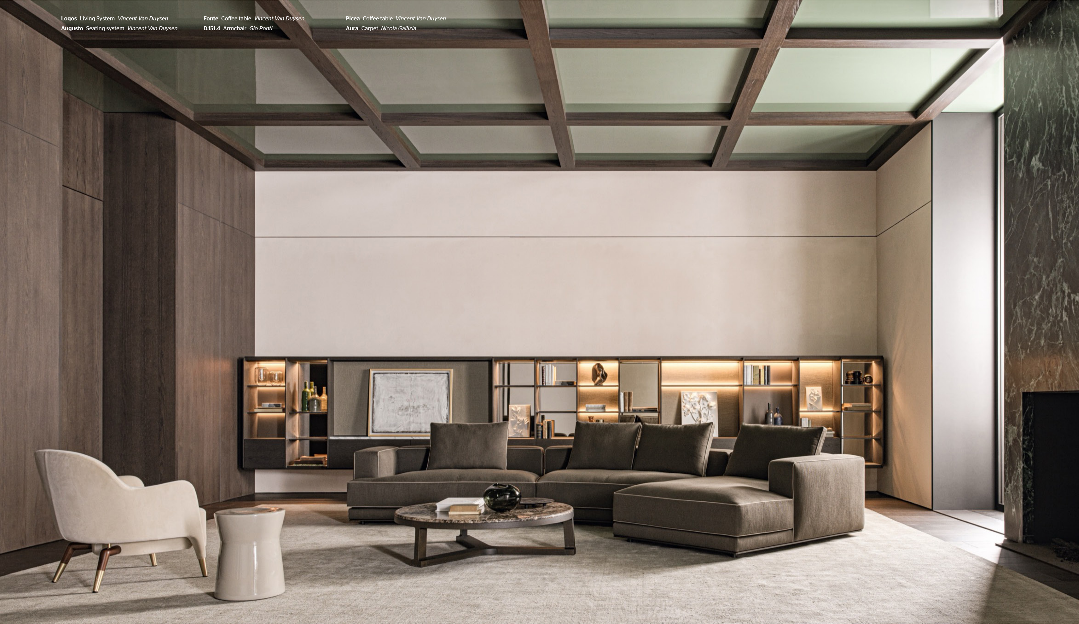
Logos Living System Vincent Van Duysen Augusto Seating system Vincent Van Duysen