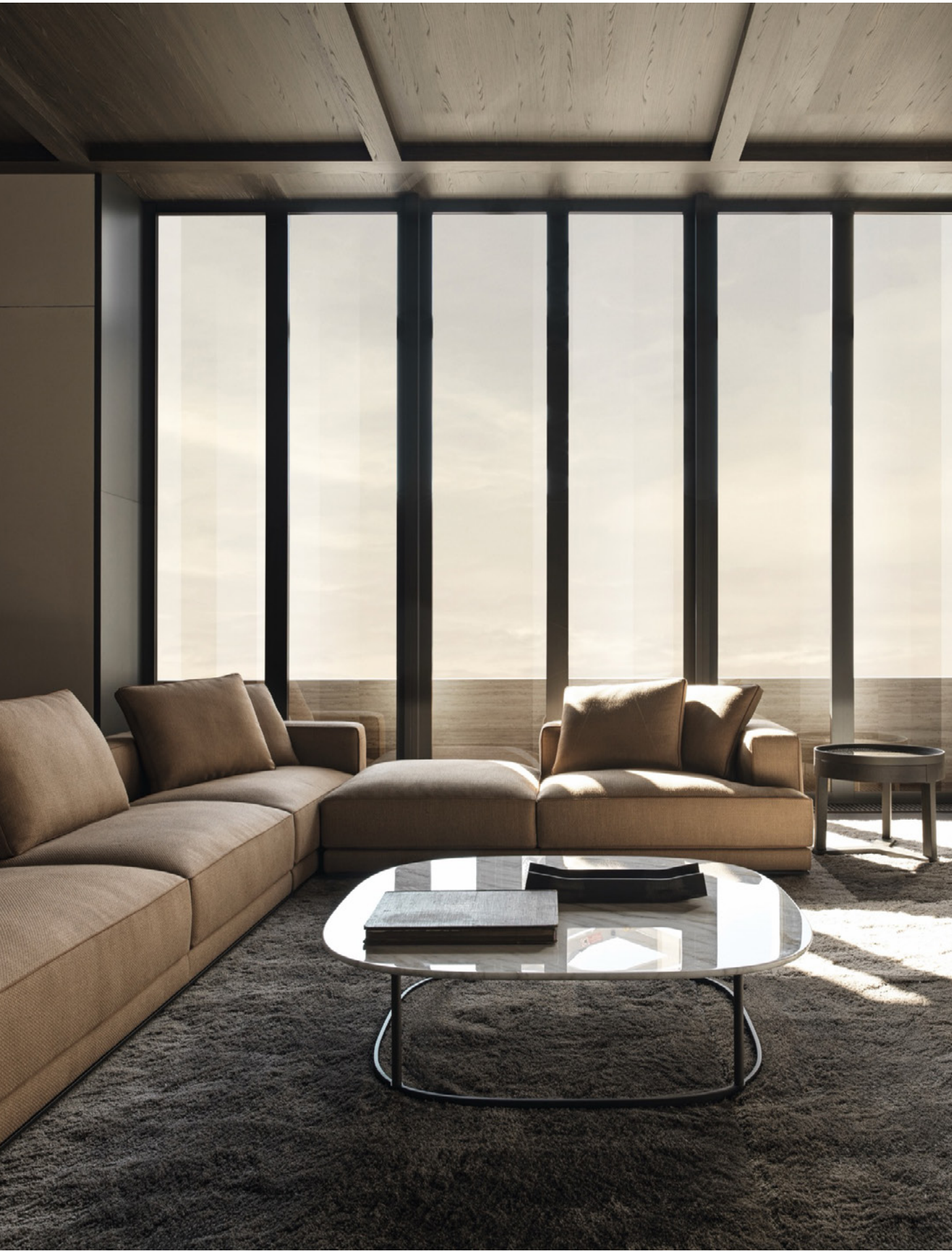
Augusto Seating system Regent, Fonte Coffee tables Vincent Van Duysen Eone Carpet Nicola Gallizia