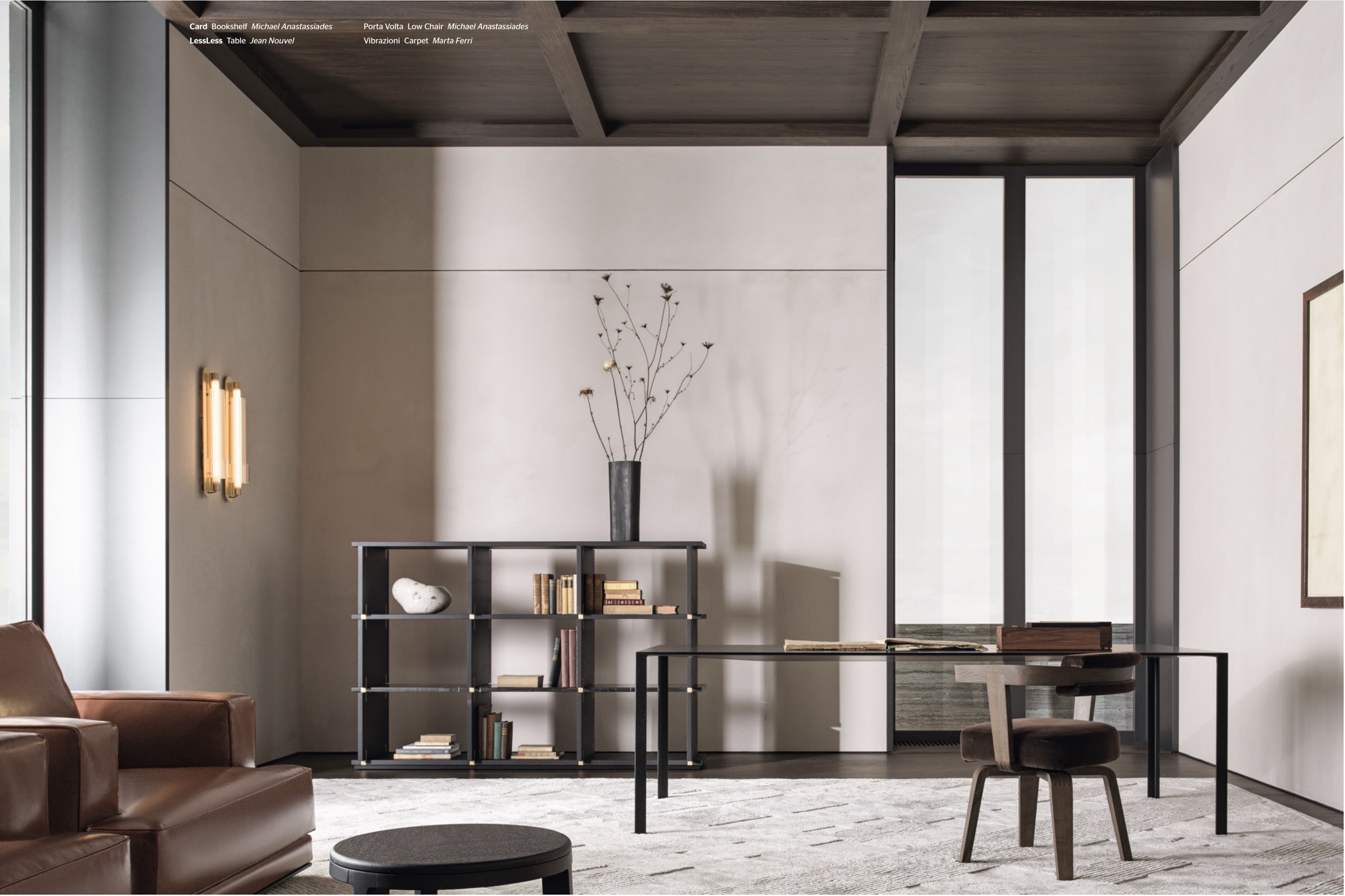
Card Bookshelf Michael Anastassiades LessLess Table Jean Nouvel