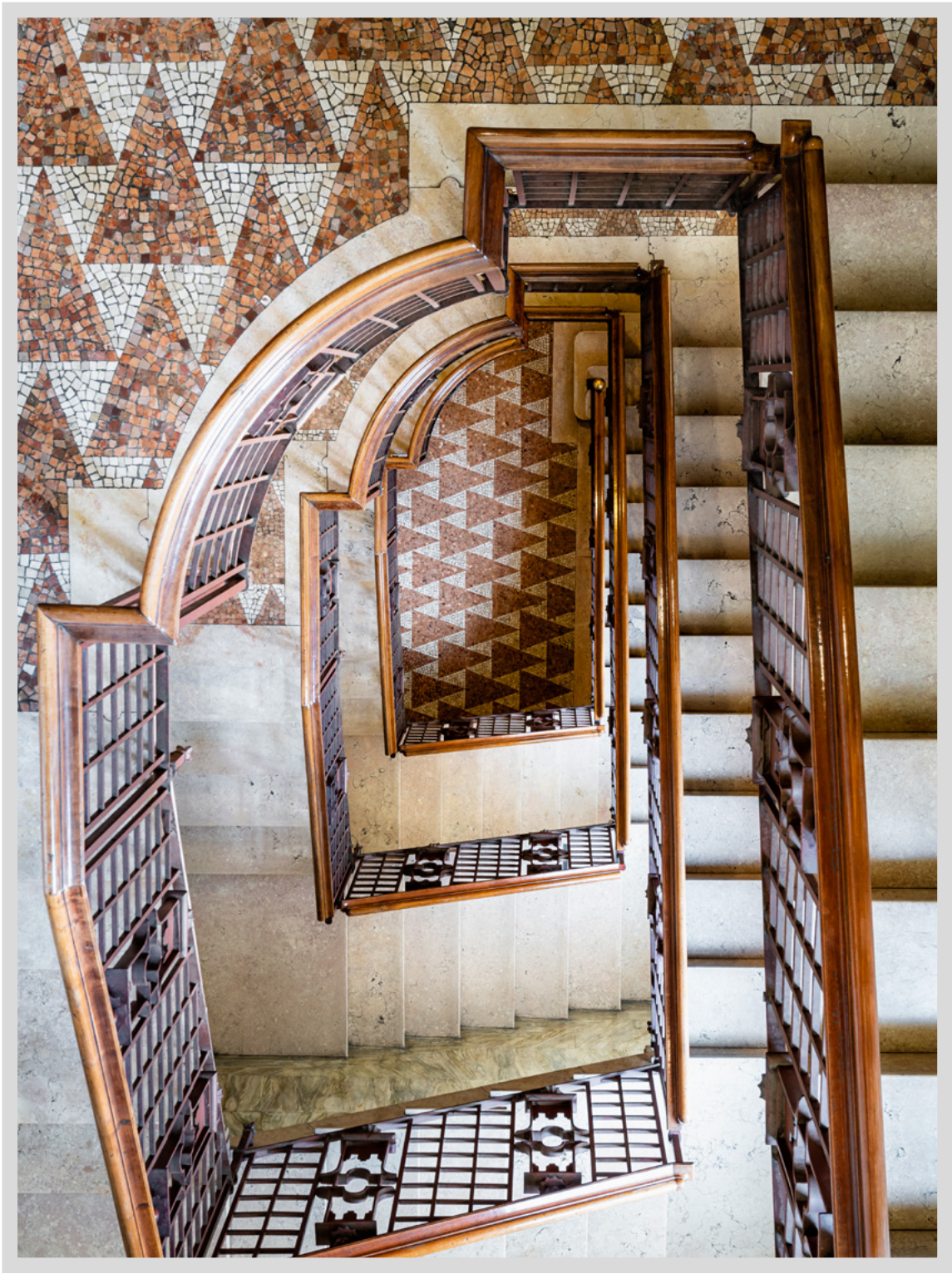
CASA BOSCHI DI STEFANO, THE STAIRS WITH THE GEOMETRIC PATTERN IN THE PAVING